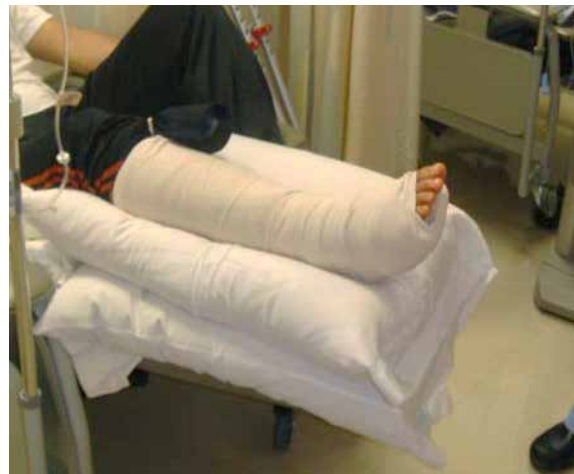
Elevate your leg on two pillows to keep it above the heart.